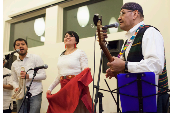
Office of Multicultural Affairs, Heritage Series: Sounds of Latin America

For additional information on resources, campus programs, student affinity groups, and more, visit grad.uchicago.edu/diversity