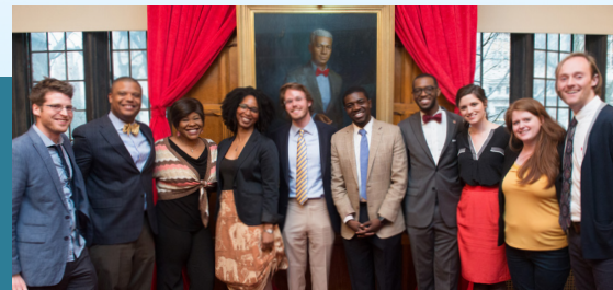
Divinity School 150th Anniversary, Benjamin E. Mays Portrait